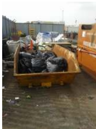
Site visit photos: red dog bin at Pittville Park and skip at the Depot