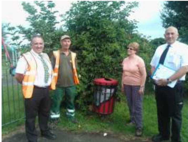
Site visit to the Beeches Playing Field, Charlton Kings with a Community Protection Officer and representatives from Ubico