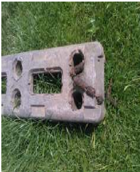
Evidence of Dog fouling on a site visit

RECOMMENDATION 1 : Ensure press releases are issued to provide information about the council's efforts to tackle dog fouling and successful enforcement action. These should include the level of fine each offender is ordered to pay and whether additional costs were incurred.