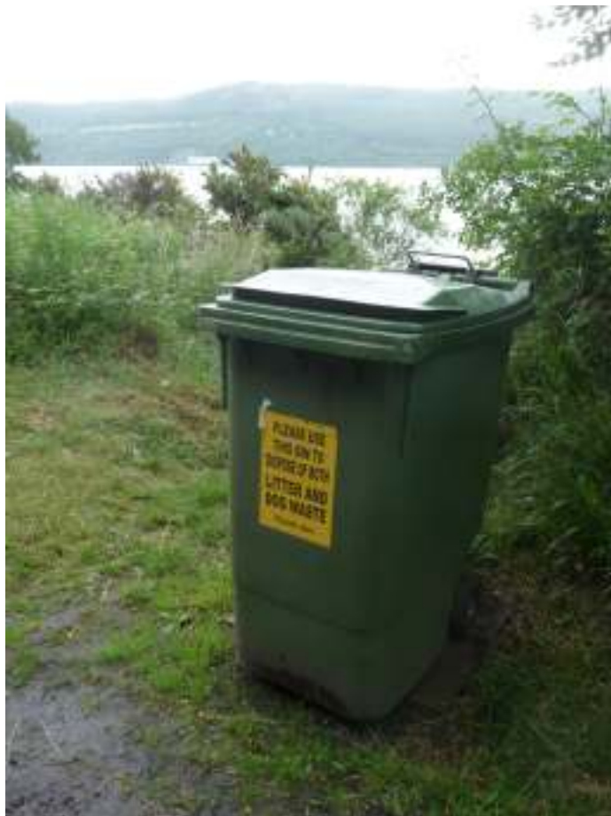
Example of stickered bin, Loch Ness

RECOMMENDATION 2 :Introduce bin stickers to highlight that bagged dog waste could be disposed of using standard public litter bins / investigate sponsorship opportunities of bins