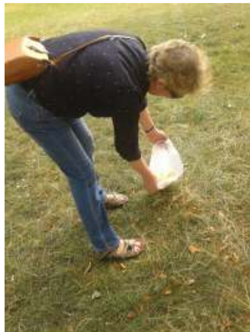
The majority of dog owners are responsible